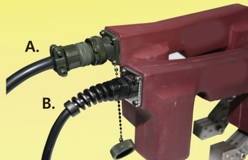
A. Cable Connector Type