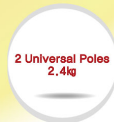
2 Universal Poles 2.4kg