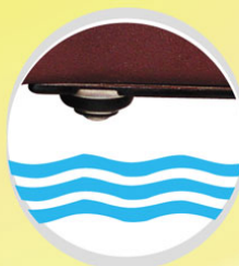
Waterproof Micro Switch