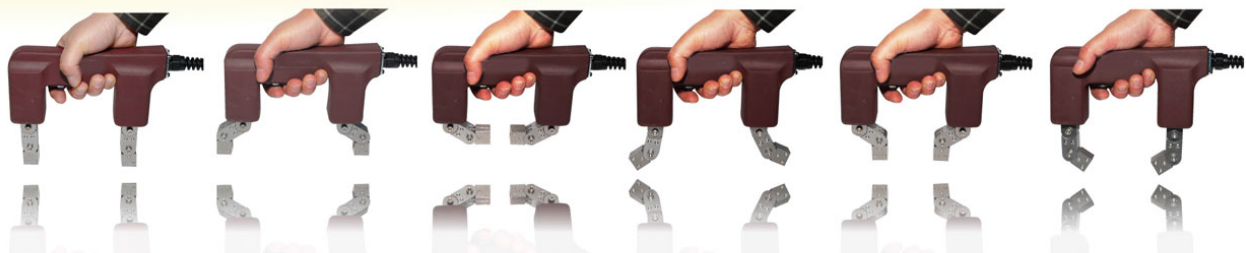
B. Intergrated Cable Type